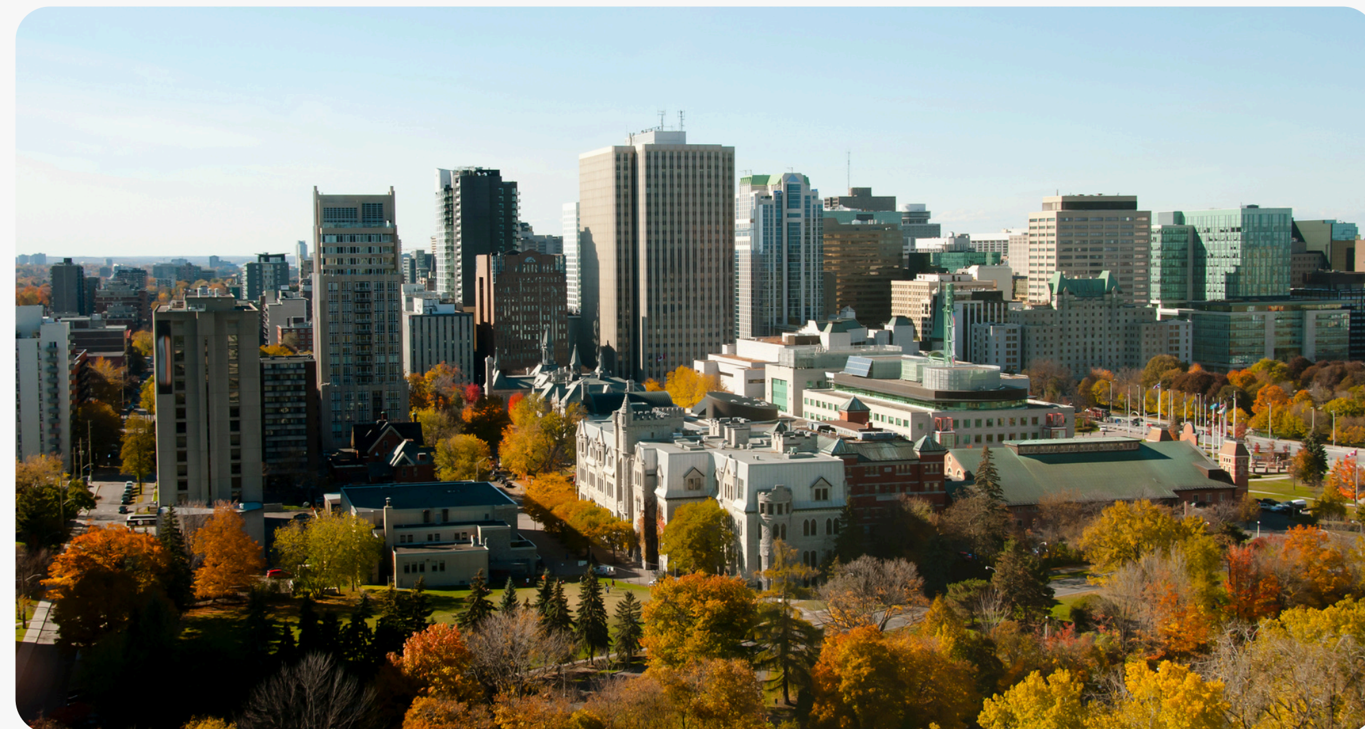
Autumn in downtown Ottawa with foliage surrounding the cityscape.

Please email events@cooperation.ca if you have questions.