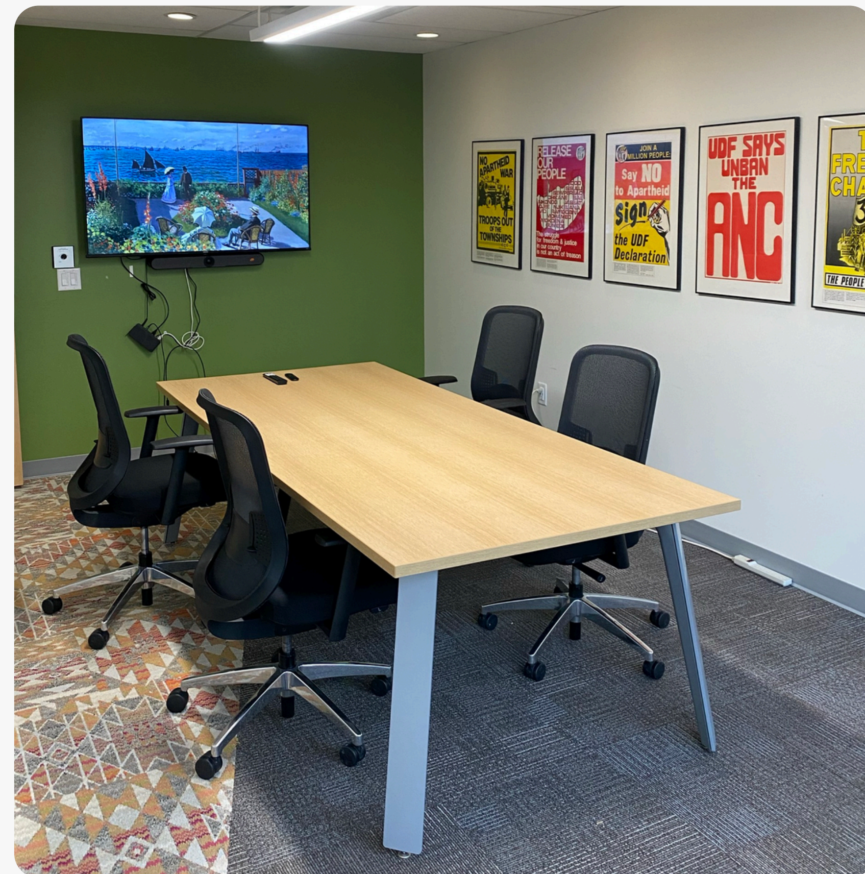
W4, Medium boardroom with large TV