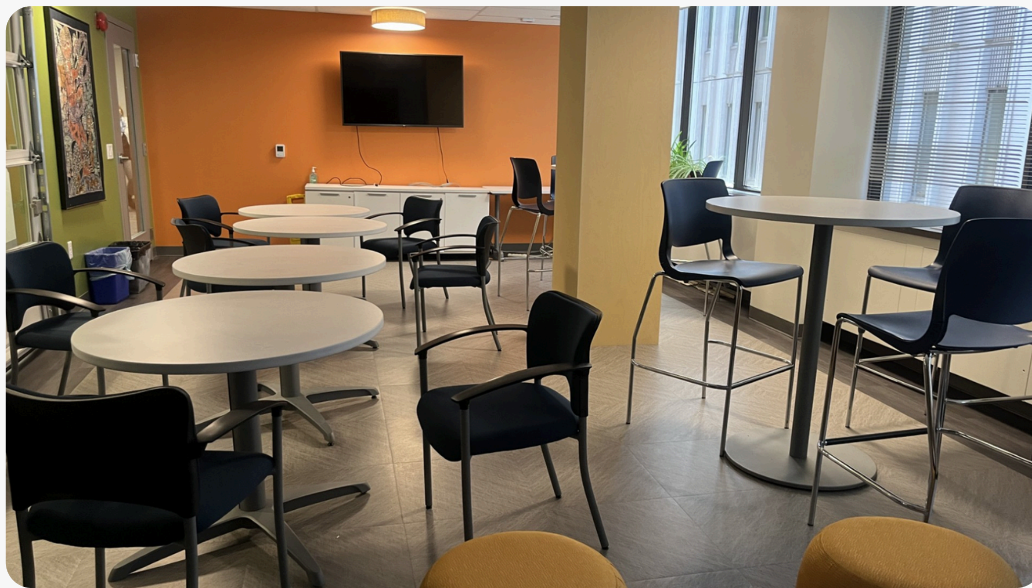
W21, Event, lunch and reception space