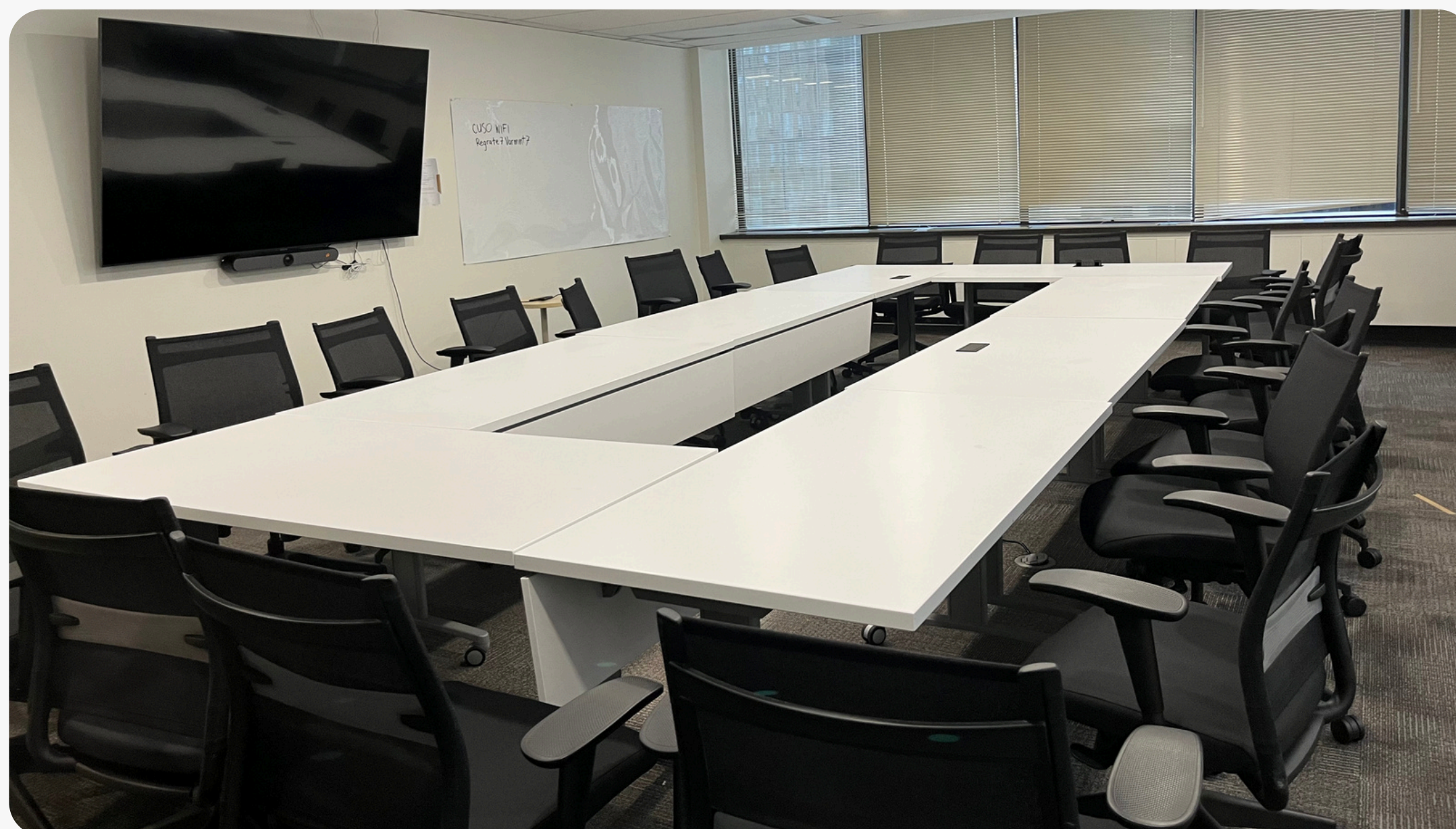
W19, Large boardroom with large TV