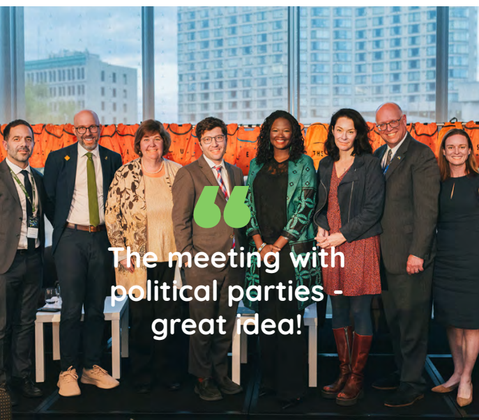
The meeting with political parties - great idea!